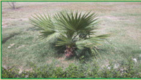
Campus Green Posture- Readdressed