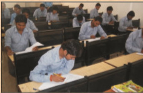
Students busy writing.... Conduction Of PUT