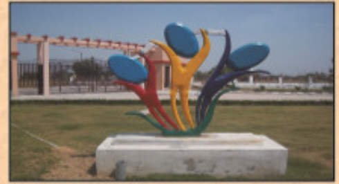
Campus Logo Redesigned and Renovated