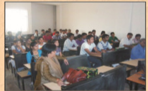
Third phase: All India Quiz Contest